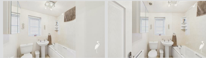
Low level WC, wash hand basin, bath with overhead shower, part tiled walls, tiled floor, fitted cabinet, double glazed window to the rear and a radiator.