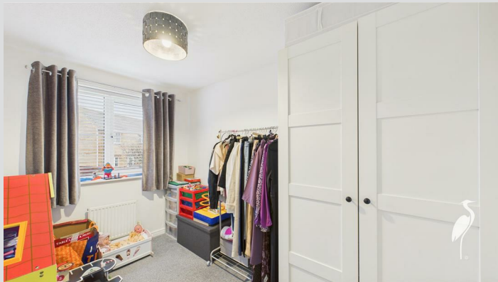
Double glazed window to the rear and a radiator.