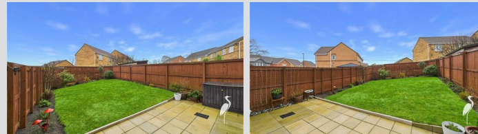
To the front there is an attractive garden with a gravelled driveway whilst to the rear is a superb generous garden laid mainly to lawn with a delightful patio area and planted borders.