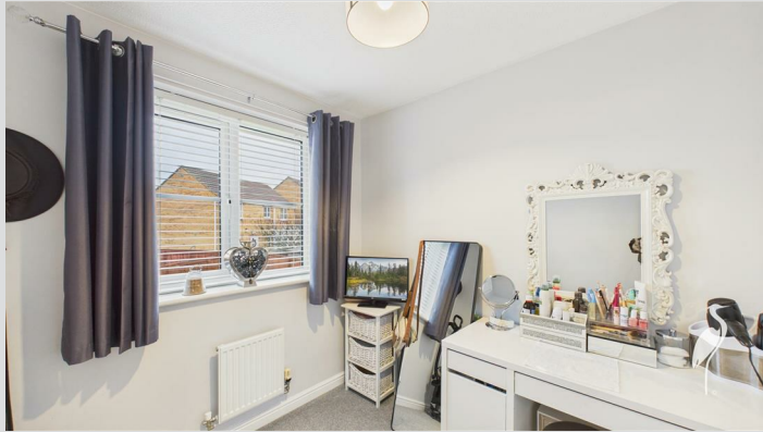
Double glazed window to the rear and a radiator.